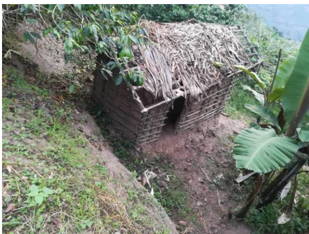
The old toilet – hardly worth the climb!

boards at a special school, living with the family in school holidays. When at home, he had to crawl or be carried to the toilet – an expedition which his grandfather also found challenging.